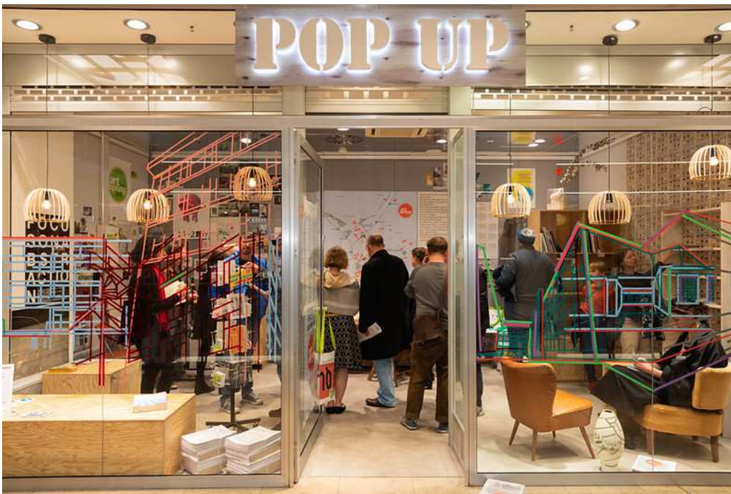
artspring 2019 / Opening artspring Festival, Pop Up Shop at Schönhauser Allee Arkaden

ALW: You have arranged several unconventional venues, where films, concerts, readings, performances and exhibitions are shown. One venue, the pop up shop, is located in the shopping mall at Schönhauser Allee Arkaden, where each day during May a different artist will be on site. What happens in this showroom?