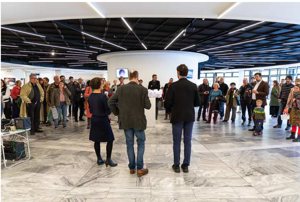
artspring 2019 / Exhibition Opening "artspring dezentral" at the Zeiss planetarium

JB & JG: In the artspring store you can get the catalogue and further information material on many of the participating artists. Each day the store is occupied by different artists from the district, who each bring their own things – so you can see something new every day or get into conversation with new people. From time to time, performances take place.