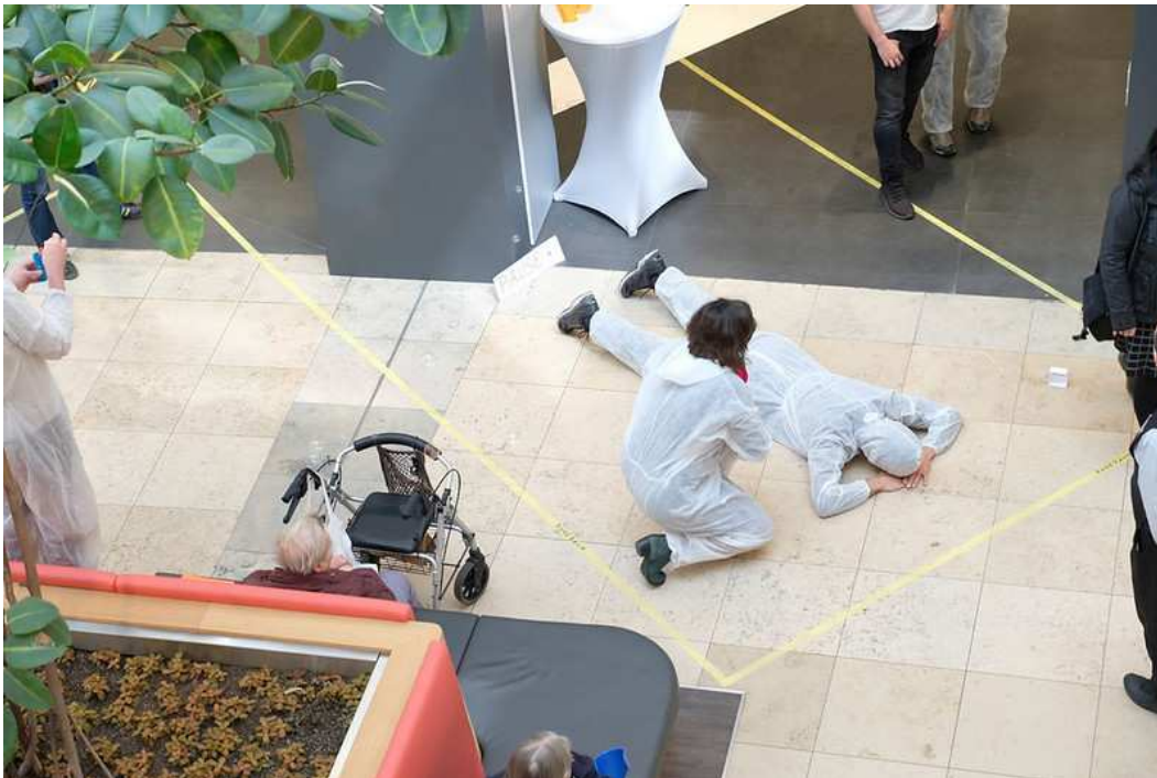
artspring 2019 / KEP Raumforschungslabor at Schönhauser Allee Arcaden