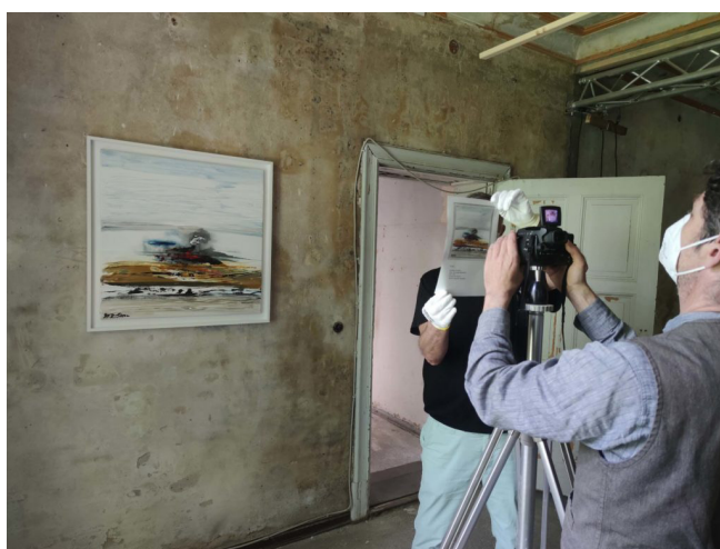
Impressions from 2021: Short-term artistic interventions in the caretaker's house / cultural chapels at the St. Marien / St. Nicolai Cemetery.

All pictures are available in high resolution and will be sent to you on request.