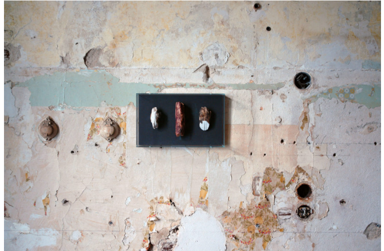
Yuyu Hollmann.